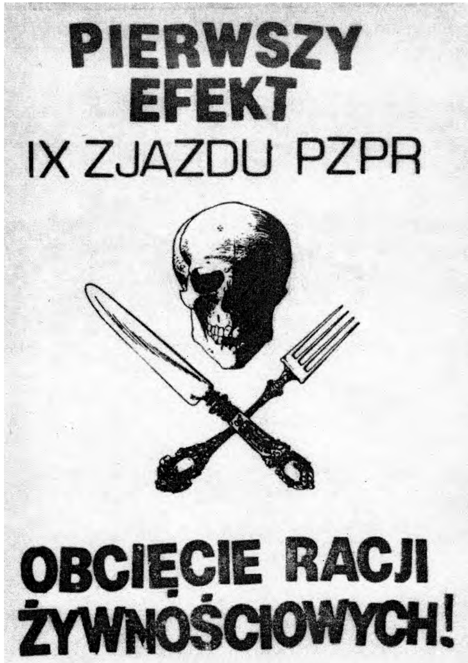
A poster published in Poland in 1981. It says 'The first result of the Ninth Communist Party Congress: a cut in food rations'.