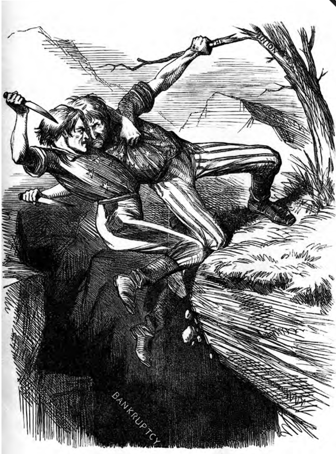
A cartoon from an English magazine, June 1862. The two figures represent the North and the South.